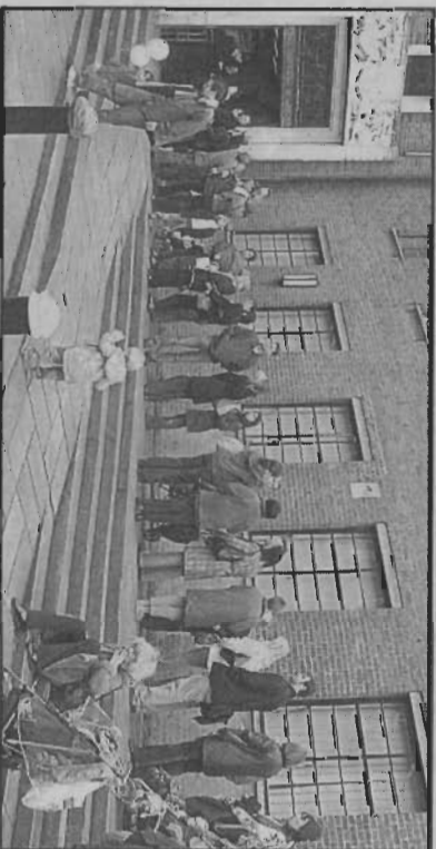
■ MORE than 1,000 people queued for a guided tour around Hornsey Town Hall

be a festival of remembrance there every year, and the theatre would be packed out.